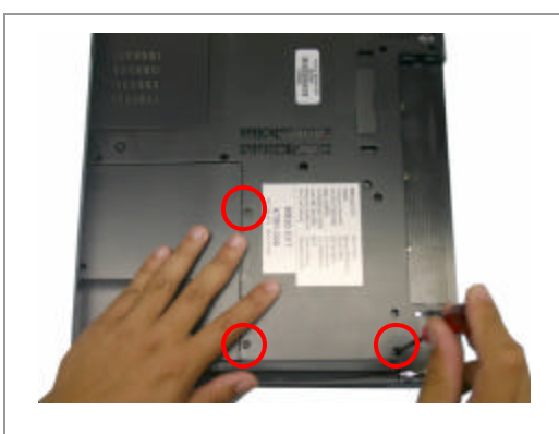
Step 4. Remove the ODD Bay. Using the enclosed magnetic screwdriver, loosen up the three (3) screws securing the ODD Bay.