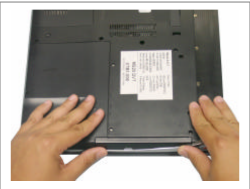
Step 9. Make sure the new ODD Bay is seating flush on the edge of the computer.