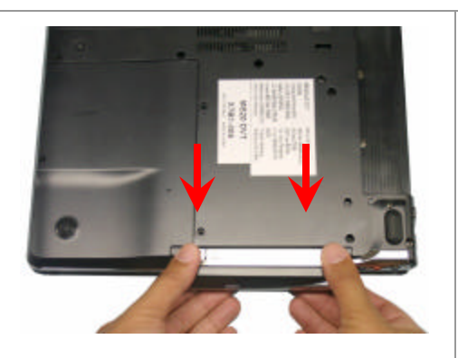
Step 5. To initiate the removal of the ODD Bay, pull slightly the ODD door as shown in the picture.