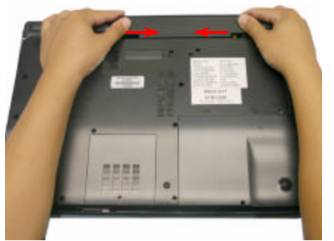
Push tabs in the release direction

Place the computer upside down on a protected surface with the front edge facing you.