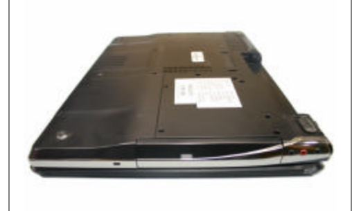
Step 3. Locate ODD Bay.

Locate the two tabs as shown in the picture. One is on the left end of the battery pack, and the other is located on the right side. Using your thumbs and fingers push both tabs in the release direction; gently push the battery pack away from you.