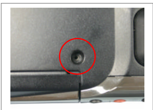
Step 10. IMPORTANT! Make sure the three (3) mounting holes are aligned properly.