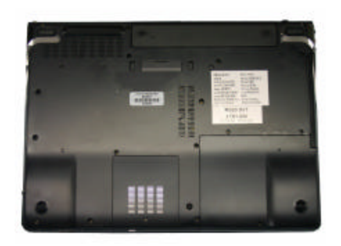
Step 1. Prepare the Computer.

CAUTION: Make sure the computer is turned off, the lid is closed, and the AC Adapter is disconnected. Failure to do so can result in damage to the computer.