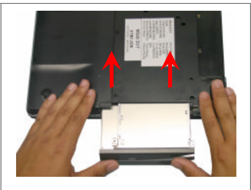
Step & With an even force slide in the new ODD Bay.