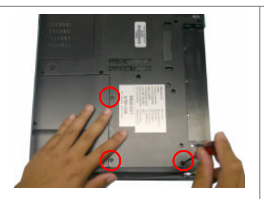
Step 11. Reinstall the three (3) previously removed screws.