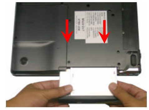
Step 6. With even force slide out the ODD as shown. Some force may be required to unlock the ODD from the connector.