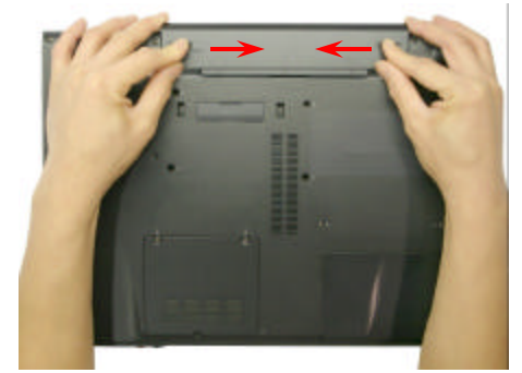
Push tabs in the release direction

Place the computer upside down on a protected surface with the front edge facing you.