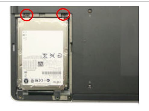
Step 5. Using the enclosed magnetic screwdriver, remove the two (2) screws as indicated in the picture.