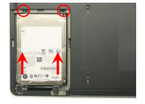
Step 9. Align the HDD with the connector and with even force push in the new HDD. Reinstall the two (2) previously removed screws.