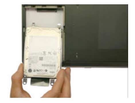
Step 8. Hold the new HDD by the edges and slide it inside the opening in an angle.