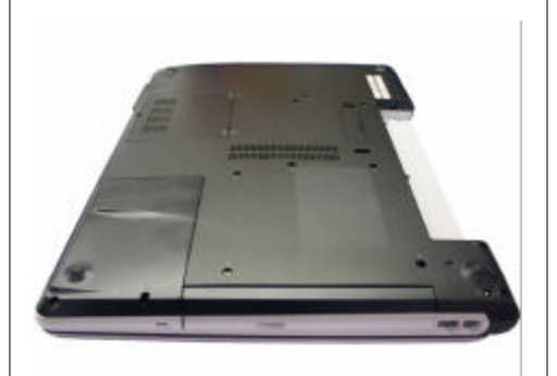
Step 3. Locate HDD Bay.

Locate the two tabs as shown in the picture. One is on the left end of the battery pack, and the other is located on the right side. Using your thumbs and fingers push both tabs in the release direction; gently push the battery pack away from you.