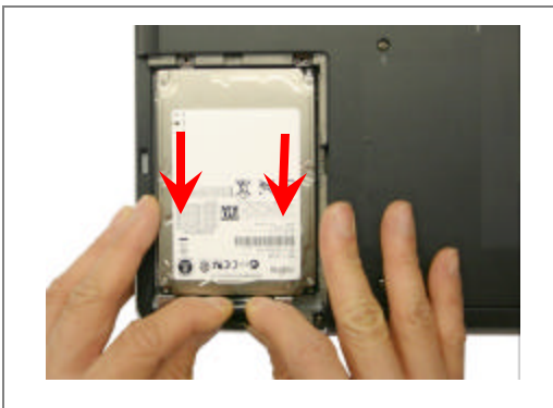
Step 6. With even force slide the HDD by pulling the plastic tab on the direction of the arrow. Some force may be needed to unlock the HDD from the connector.