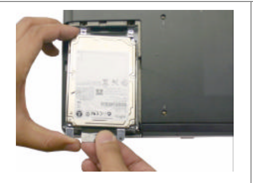
Step 7. Gently pull out the original HDD away from the computer as shown.