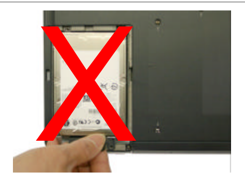
CAUTION: Do not pull the plastic tab upwards before releasing the hard drive from the connector!