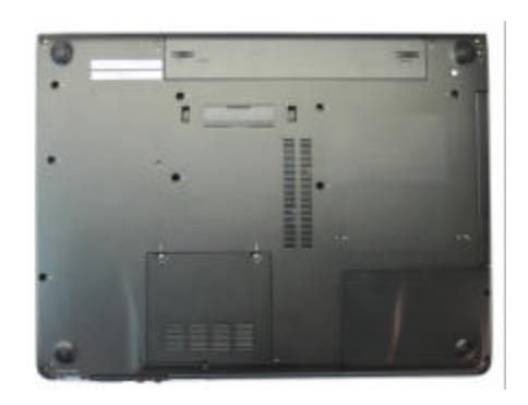
Step 1. Prepare the Computer.

CAUTION: Make sure the computer is turned off, the lid is closed, and the AC Adapter is disconnected. Failure to do so can result in damage to the computer.